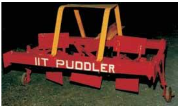
Improved device for wet soil preparation