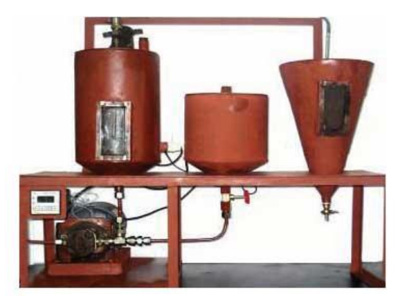
Biodiesel production from nonedible oils