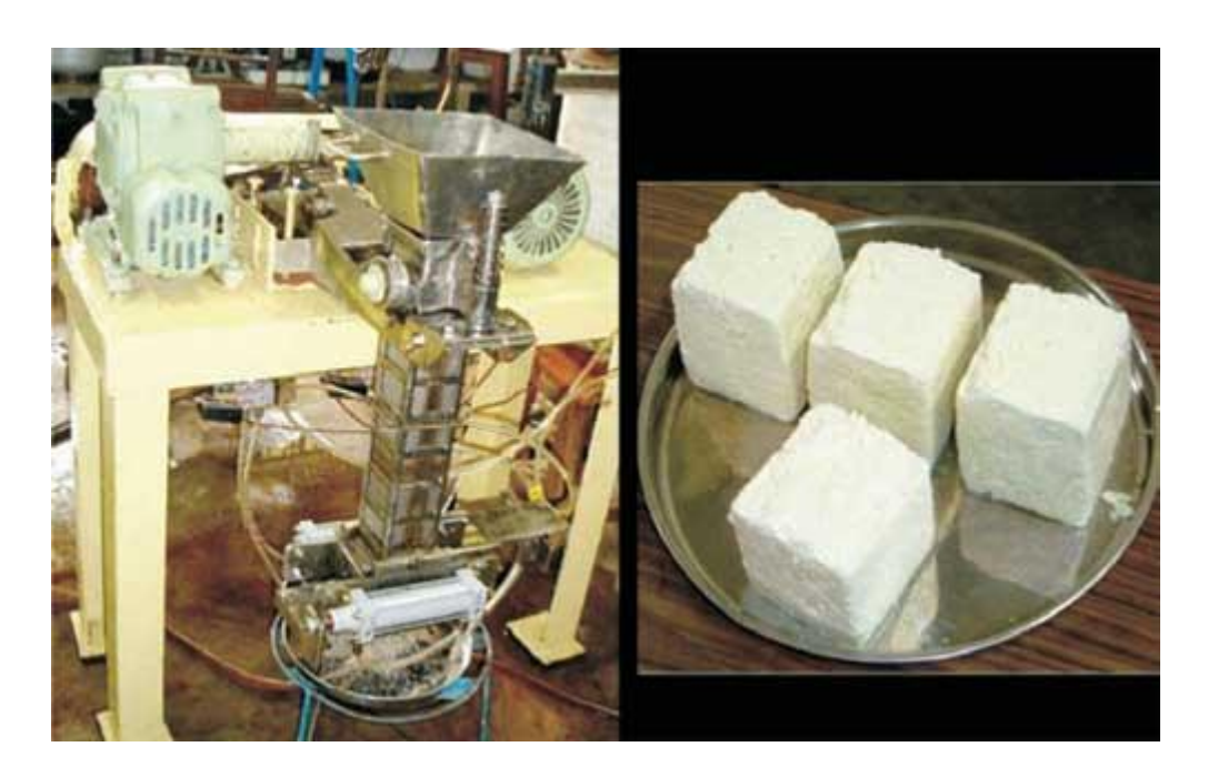
Mechanized production of Indian milk sweets